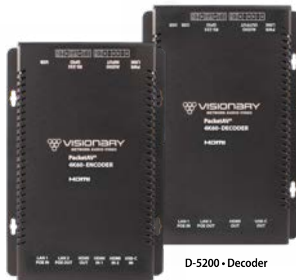
E-5200 • Encoder

Visionary Solutions' PackeTV® and PacketAV® products can be deployed on any industry-standard IP network, either on existing enterprise IP networks or a physically separate parallel network (private network), ensuring easy installation and minimal disruption to data or voice traffic.