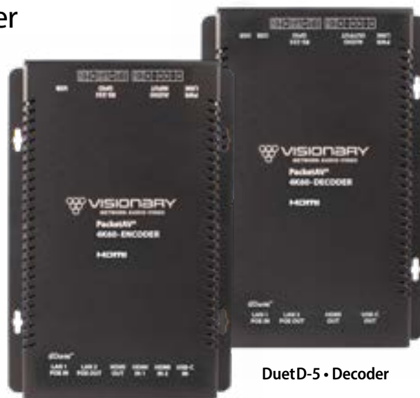
DuetE-5 • Encoder

Compatible with industry-standard IP networks, Visionary's PacketAV® and PacketTV® products can be deployed on existing enterprise networks or separate private networks for dedicated video traffic. This versatile approach simplifies installation while